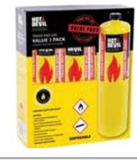
TRADE MAP GAS VALUE 3 PACK HDTP